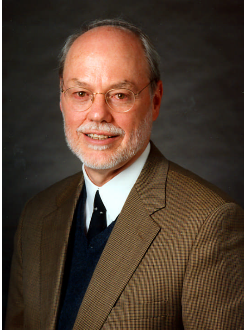
Phillip A. Sharp